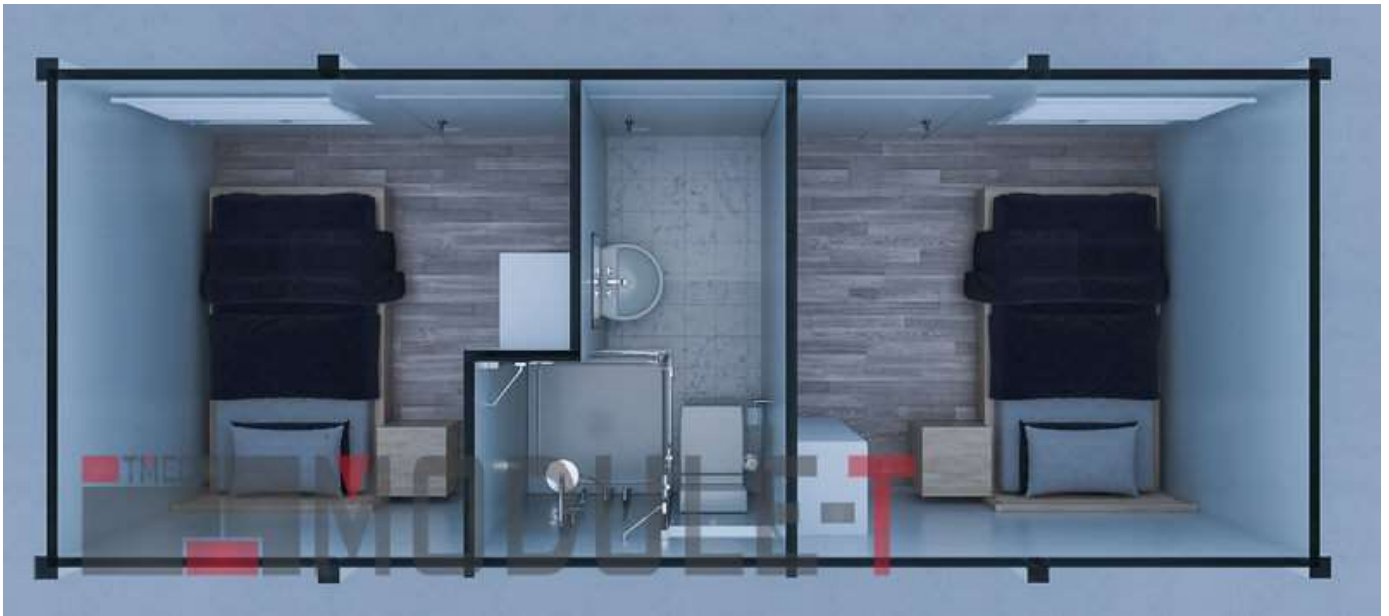
20 feet shared accommodation container