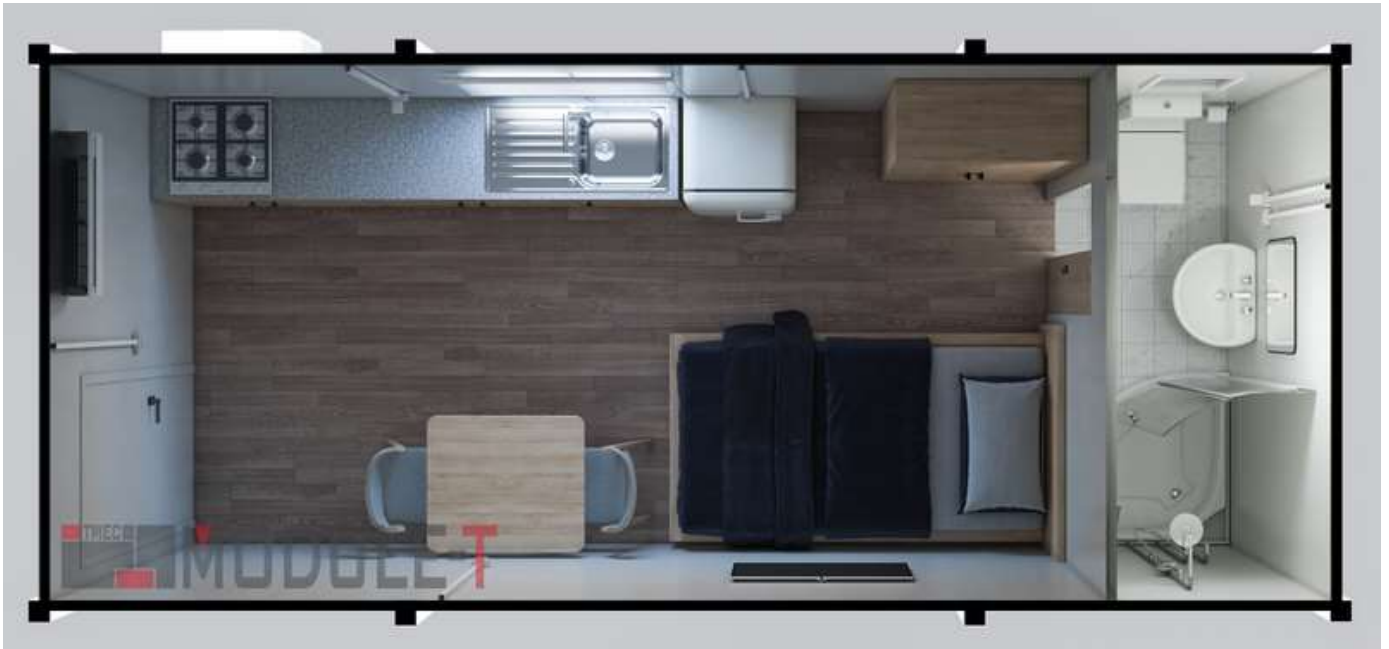
20 feet accommodation container with kitchen